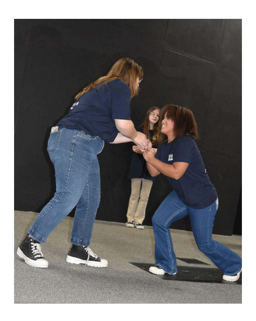
Meet the director! Click here for details about our talented cast.